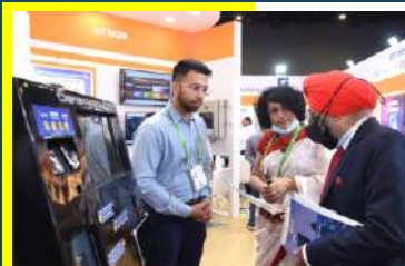
Brigadier Bedi Ministry of Defence