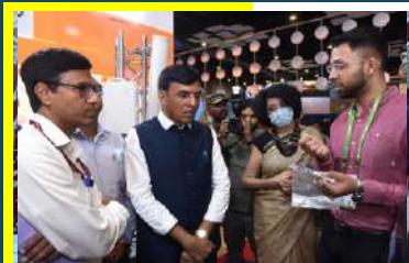
Sh. Dr. Mansukh Mandaviya Minister of Health